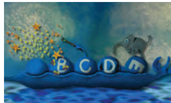
AWESOME BEETLE'S COLOURS

When he makes a new friend, the pocket man realises that acts of kindness come in all shapes and sizes.