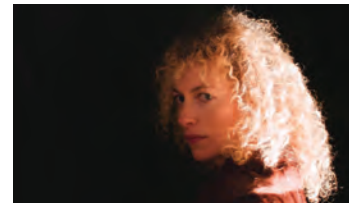
UNTITLED GROPING REVENGE FAIRYTALE

A teenage misfit starts a band only to lose control to the school bully. I cannot believe this director was not born in 1975! A tribute to high school bands, the Gordons and what elevation from dorkhood a guitar can accomplish.