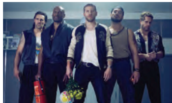
DO NO HARM

A frustrated mum struggles to find intimacy while raising a young family. A real woman's sexy adventure elevating domestic life and putting the poems of Hone Tuwhare in a place not usually found!